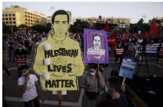
Figure 3: Protesters Attend a Rally Against Israel Plans to Annex Parts of The West Bank in Tel Aviv