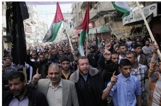
Figure 2: Palestinians are uniting for a general strike

violation of international law” (Middle East Monitor, 2020). Palestinian leaders had already refused the initiative of this annexation proposed by President Trump as a “Middle East Peace Proposal.” They refused the plan because they estimated that the plan would cover more than 30 per cent of the West Bank. While the headlines often portray the conflict as never-ending, there are many in the younger generation in Israel who have begun to have an increasing awareness of the seriousness and urgency of this issue for both sides. To show their irritation and concern, many young people gathered in Tel Aviv’s Rabin Square this past summer to protest what was called a “peace process.” (Middle East Monitor, 2020) Moreover, the types and forms of defensive against Israeli occupation, especially considering armed resistance, believed by Hamas and Iran, are rejected by many Arab countries to reduce bloody conflicts (ALMadani, 2018). The opposition from Israel to the annexation and repudiation from domesticated Arabians to violent collisions also reflect the signs calling for a rational and comprehensive solution to reverse the status quo, addressing underlying past mistakes that only appeared during the intifada.